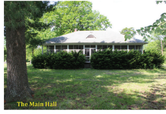
The Main Hall